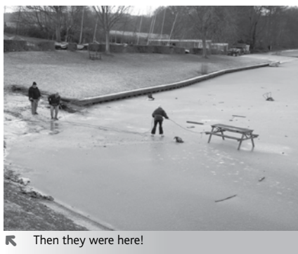
← Then they were here!