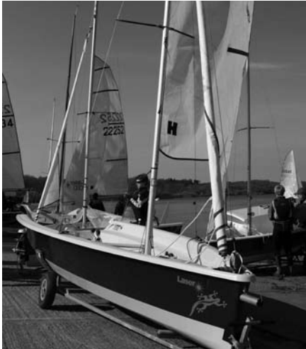
The Laser 2000 ↓

Over the next few magazine issues we will be featuring profiles of the main classes at Weir Wood. We begin with the Laser 2000 fleet. The Editor sails this class so it seemed a good choice to begin with, plus we have just had the fourth Laser 2000 Turbo Open event. Classes to follow include the Enterprise, Laser, RS, Toppers and Optimists