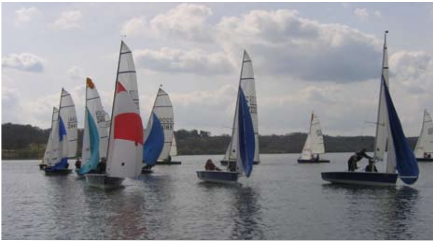
← Light wind at the Leeward mark