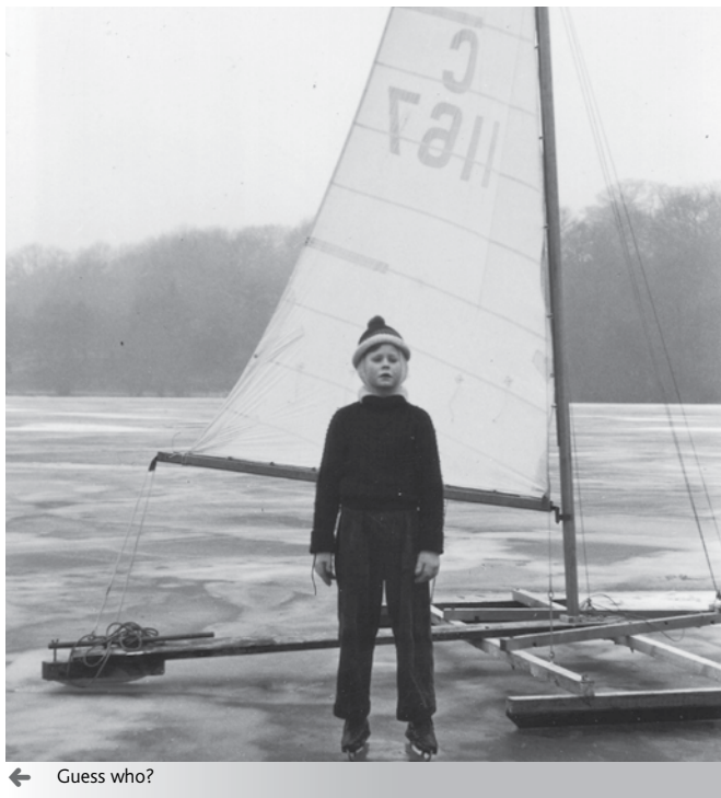
← Guess who?

This episode reminded one of our committee members of his youth when during another very cold winter his Club lake froze and his enterprising father made an ice yacht so that his sailing education could continue. Guess who it is. The clue is in this paragraph.▲