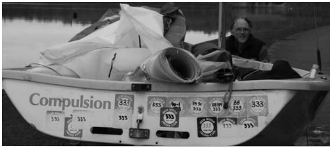
↓ What's the Oppy Club Leader up to now?