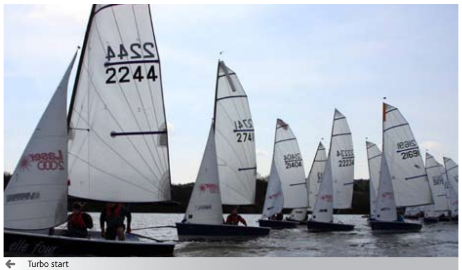
← Turbo start

Lunch was fortunately taking during a lull in the wind. The break didn’t dull