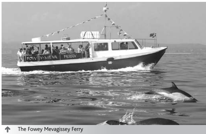
↑ The Fowey Mevagissey Ferry

I’m quite sure that it wasn’t all bad – but my life changed on my 10th birthday when I had my first flight in a glider from Firle Beacon. Now there is a worthwhile hobby! I went on to become a helicopter pilot, did a bit of farming and even worked for the railways. Nine years ago – quite accidentally – I bought a ferry. Sir Joseph Porter was right, it seems, but that is another story. ▲