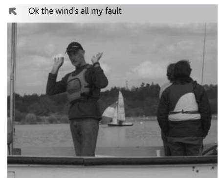
⌂ Ok the wind’s all my fault