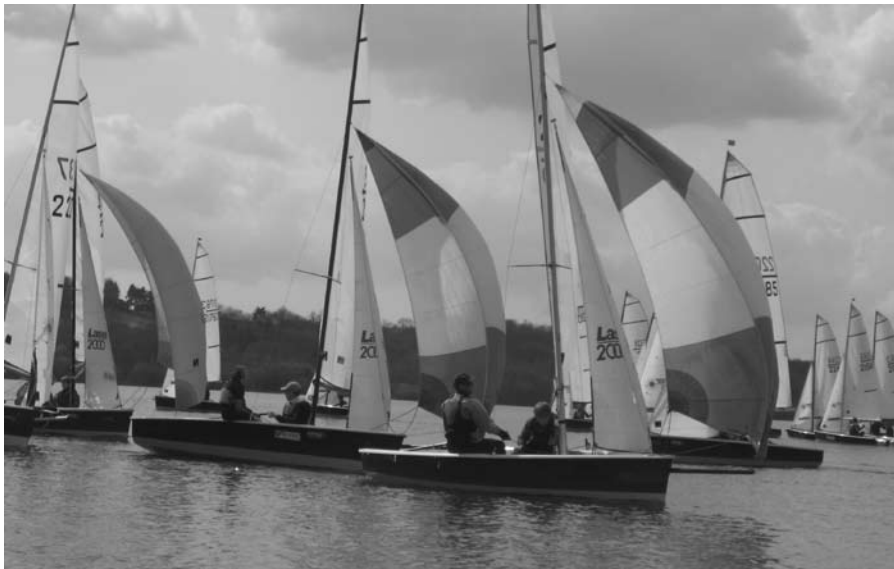
↓ Laser turbo down wind

repeated, but it was good while it lasted. However then the wind died again and I became increasingly frustrated with the lack of cooperation from the burgee and tale-tale departments. This continued, with small gusts that lightened my mood, for the next couple of races. I had decided that I did not “do” light winds, and claimed I wasn’t helming again in anything less than a force 2.