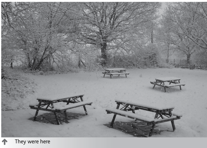
↑ They were here